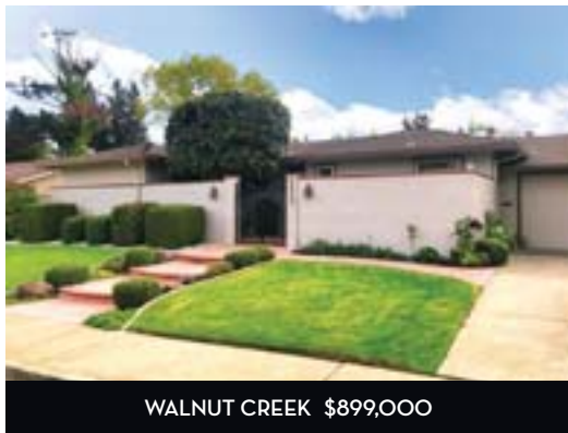
WALNUT CREEK $899,000

271 Paseo Bernal | 3bd/2.5ba Jim Colhoun | 925.200.2795 License # 01029160